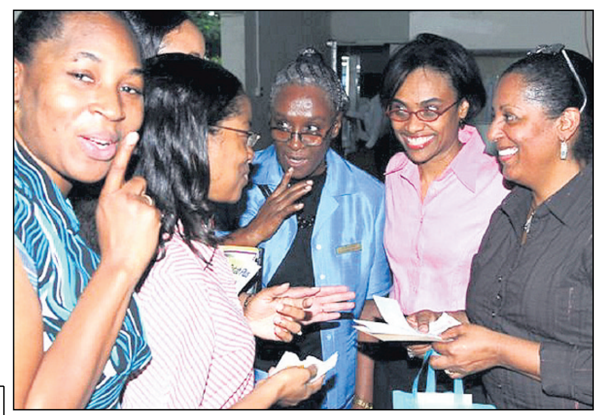
Rehab Plus staff sharing birthday secrets.

Rehab Plus is like a family to me. The staff is like a support