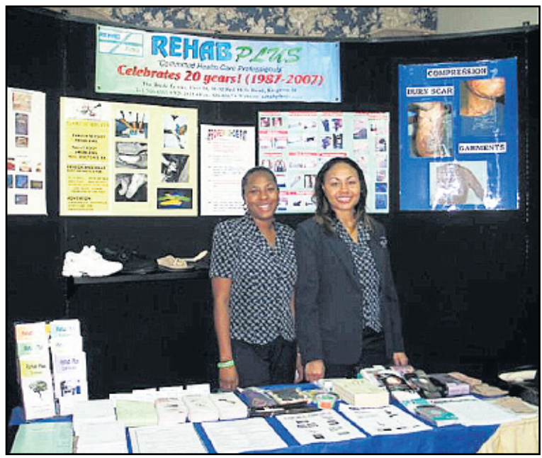
Rehab Plus staff at a 2007 health conference in Runaway Bay.