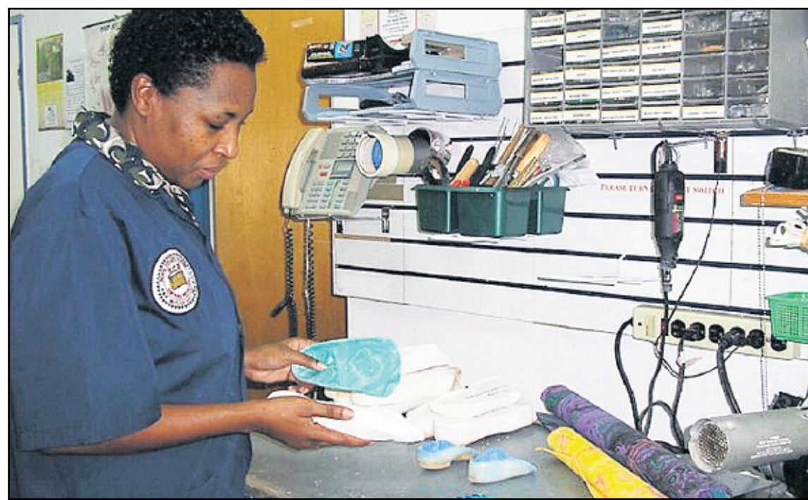
Pedorthic lab work.

From the company's inception, the vision was to develop a strong bond with customers by providing quality service with genuine warmth and caring, and to ensure that every employee of the company received training which would put them in good stead for any future undertaking. In other