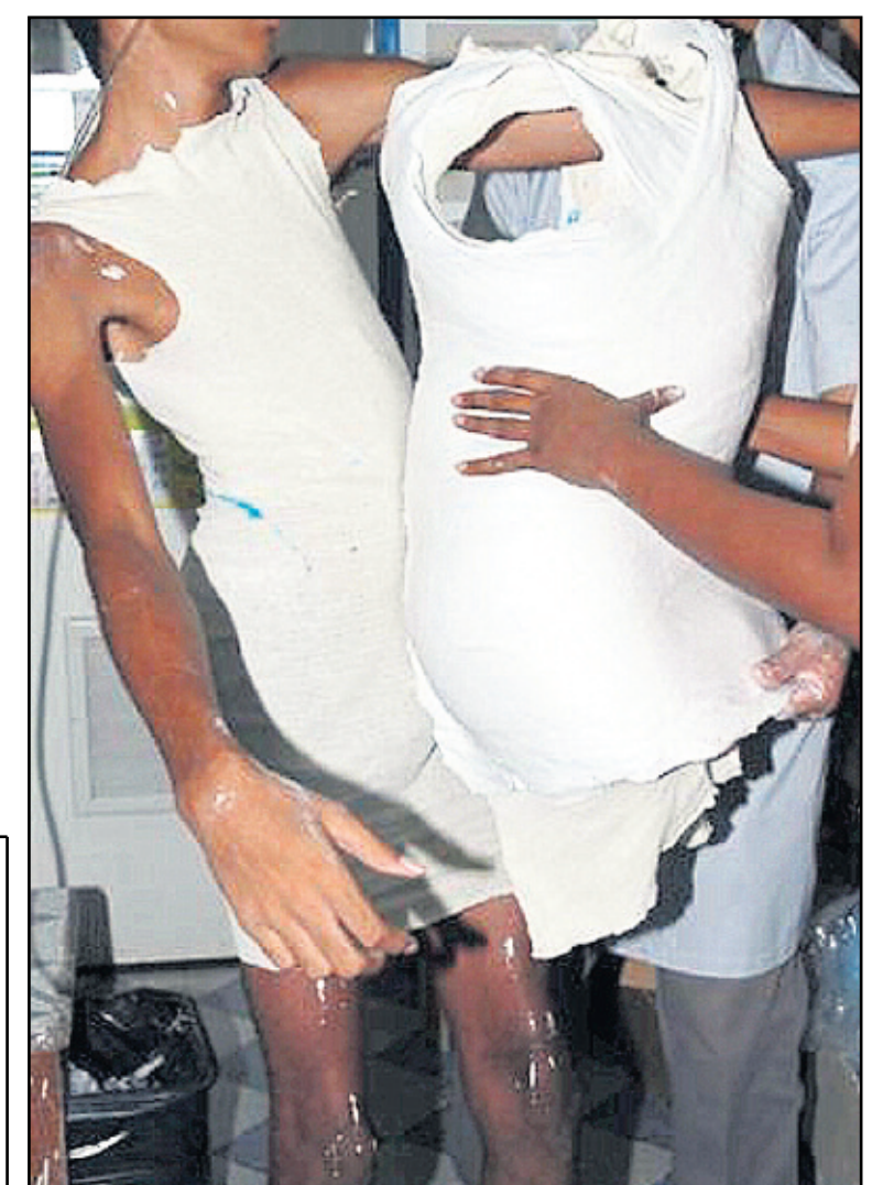
Making a plaster of Paris mold for a spinal brace.

Rehab Plus stands committed to training and professionalism of the highest order. Our commitment to service is exemplified by the strength of our belief in and respect for the people of Jamaica.